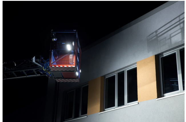
Efficient LED lighting