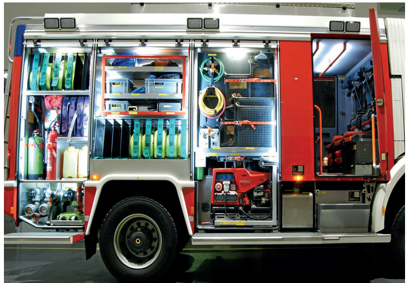
LED Compartment Illumination